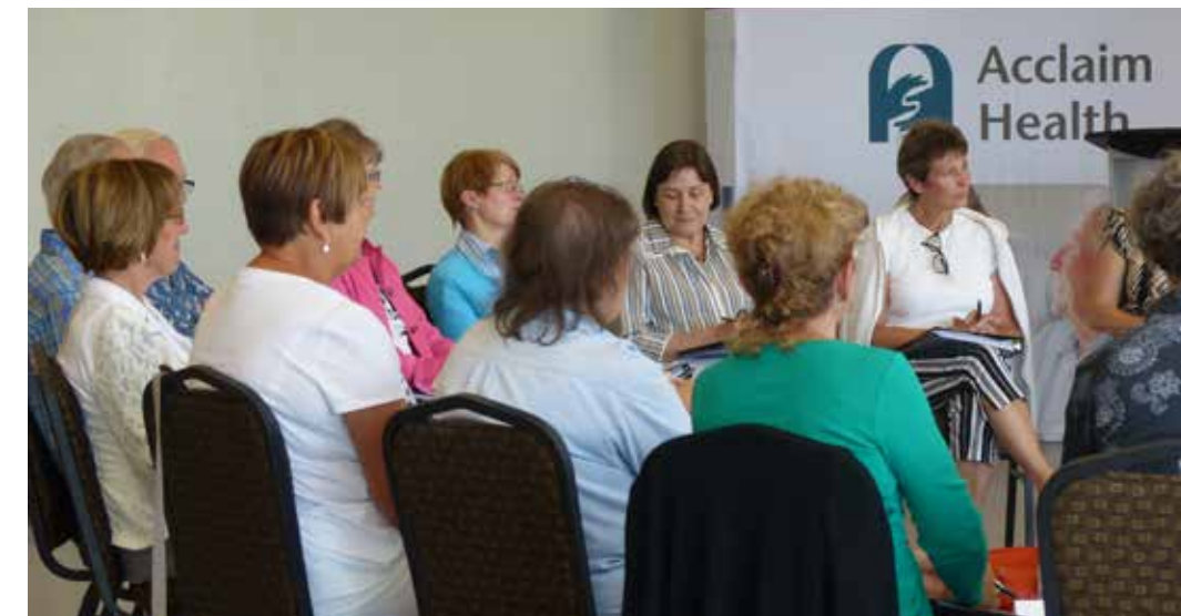
Our first-ever group of Bereavement Peer Support Volunteers completing their final training session. Congratulations!

As one client said, “My volunteer listened to me. That’s what helped.”