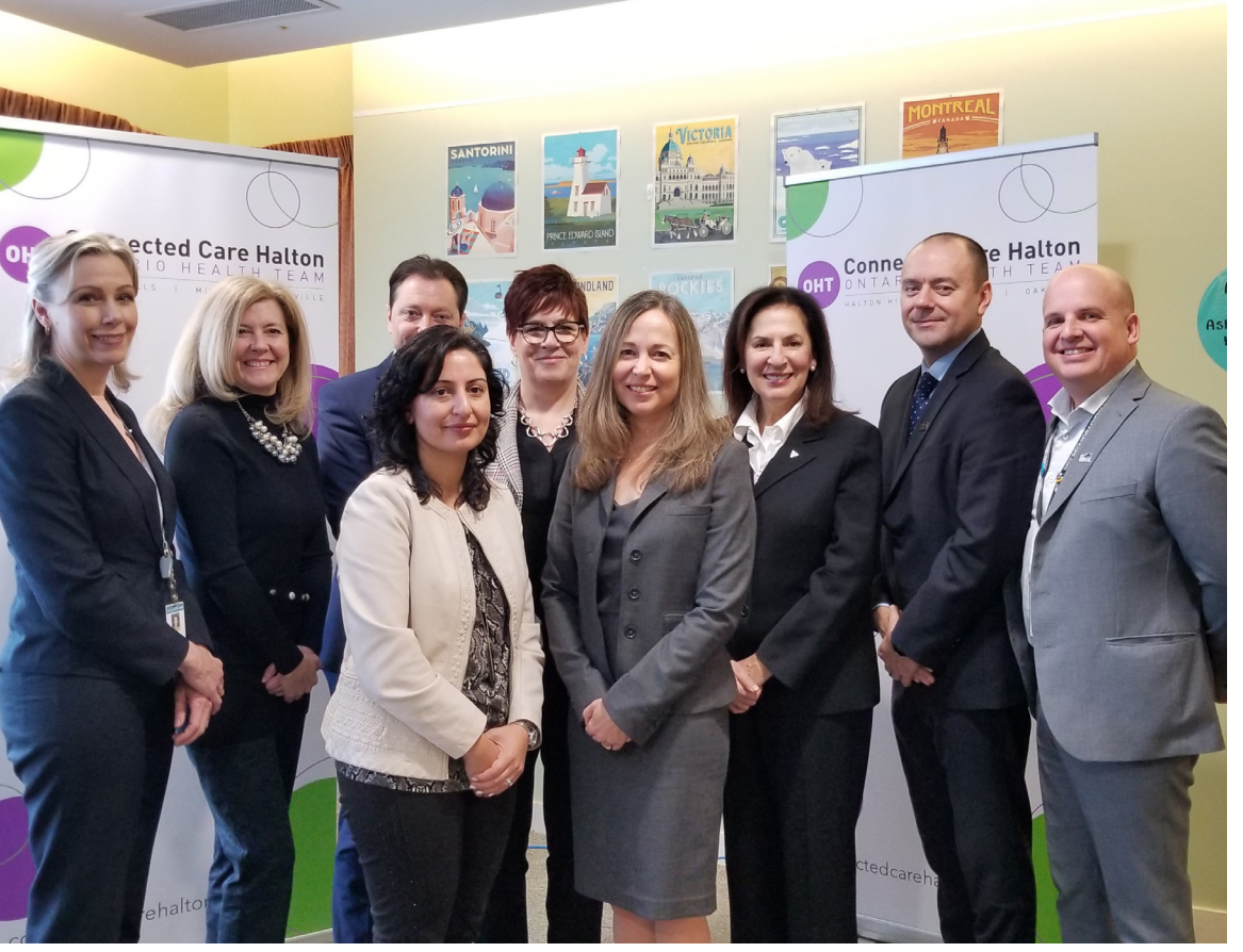
Connected Care Halton OHT Announcement at the Acclaim Health Adult Day Program. Photo taken on December 6, 2019.