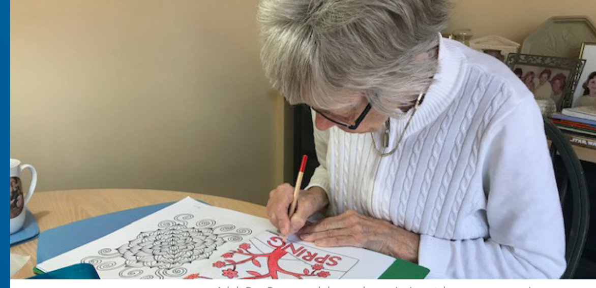
Adult Day Program club member enjoying at-home programming.