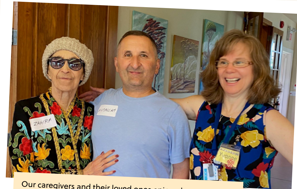
Our caregivers and their loved ones enjoyed a social picnic at Joshua Creek Heritage Art Centre.

Once again, there was a huge leap in demand for dementia related caregiver support. We helped 740 people this year - up 23% over last year - through 3,215 family consultations, support group sessions, workshops and events. More Because You Care funding will be invested in this area this coming year to better meet demand.