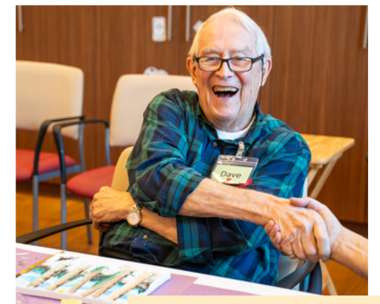
Artists at work at Patty's Place!

"We've received so much help over the years. Every time we needed you, you've been there. You've made the difficult times bearable."