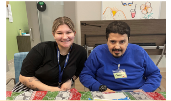
Creative club members and staff at our Mississauga Club!