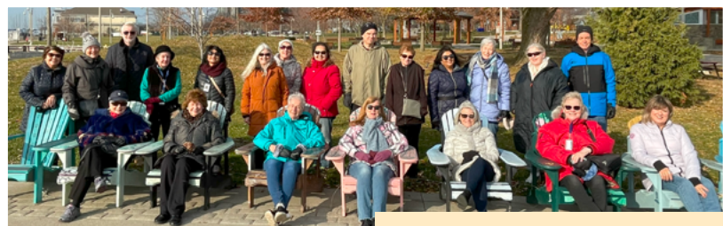
Our Bereavement Walking Group enjoying the sunshine in Bronte.