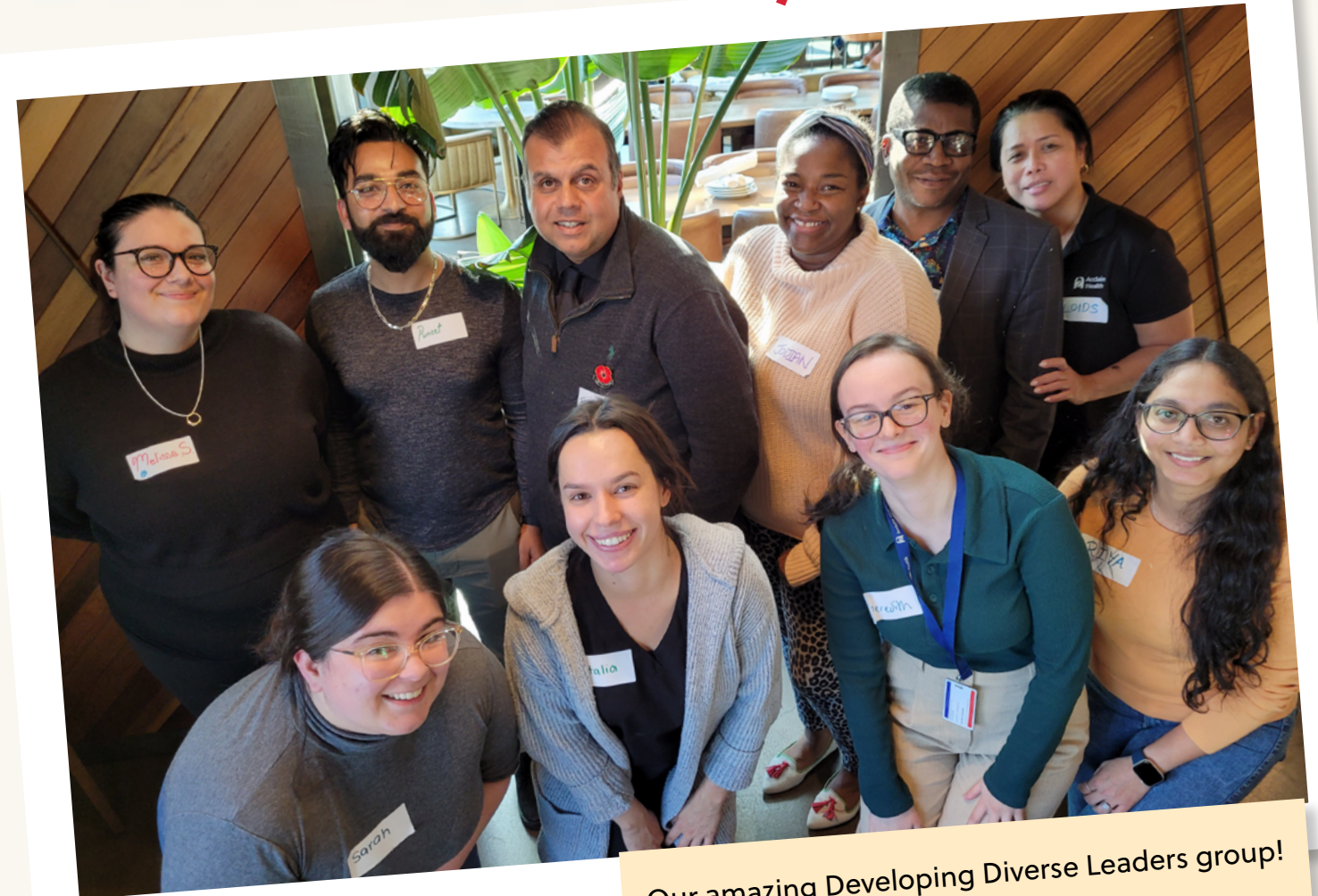
Our amazing Developing Diverse Leaders group!

To do that, we need to do better. Acclaim Health is intentionally and tangibly working towards a more equitable and inclusive community – starting with ourselves. This year all Acclaim Health team members participated in learning opportunities, started to tackle painful issues like workplace harassment, and celebrated the unique lived experiences of our team. This is only the beginning! Addressing social justice issues – within our organization and in our community – is the only way to provide extraordinary care for EVERYONE.