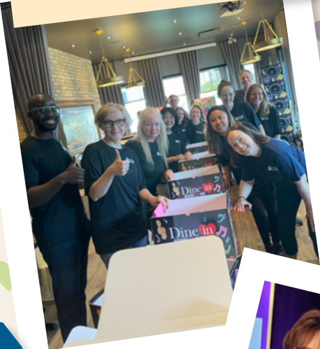
The Dine In dinner packing crew!

"I have watched Acclaim Health grow exponentially and I have grown as well - both personally and professionally. Supporting and validating clients and colleagues is both fulfilling and a privilege."