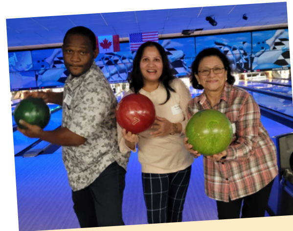
Staff bowling night - sometimes you need to have fun!